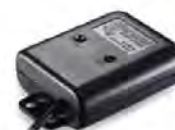
Vibration sensor A