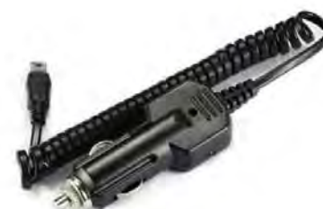
Cigarette lighter charger