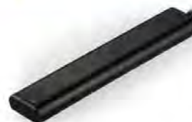
2-WAY PKE antenna