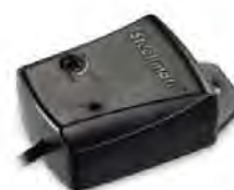
Vibration sensor B